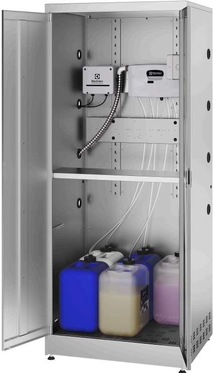
Five 20 liters detergent canisters and Jetsave stored in DS6-6P (988913102). Images for illustration purpose only.