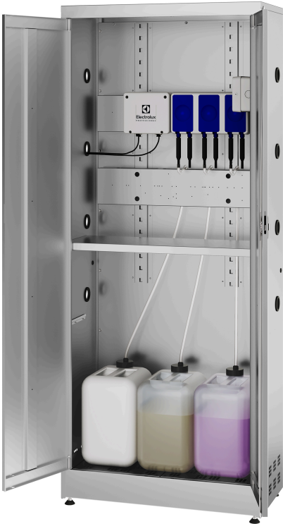
Three 20 liters detergent canisters and Dosave stored in DS6-3P (988913101).